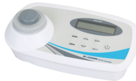
WD 100, Multiparameter Colorimeter