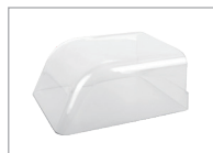
Protective lid (optional)