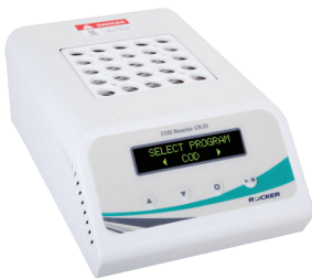
CR 25, COD Reactor