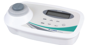
CD 200, COD Detector